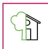
Outdoor / Indoor